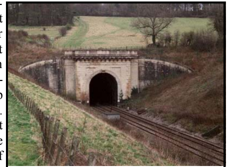
View of Box Tunnel, West portal from the A4 road over-bridge.

In conjunction with North Wiltshire RAYNET, Wiltshire Fire Service and Network Rail, the exercise is to take place on Sunday 26 November, starting at 08:00hrs. Four members of Gwent RAYNET have been invited to participate, to offer "help and suggestions". The event will start with a pre-exercise briefing at the site of the old Corsham railway station (tbc).