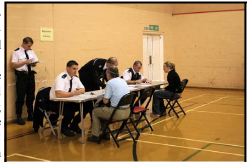
One of the Police Registration Desks where the "survivors" registered and gave the Police details of the "incident".