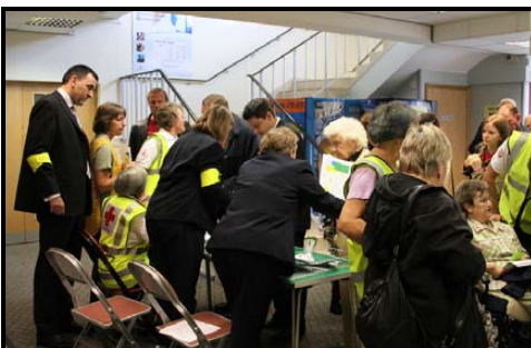
"Survivors" from the Tunnel incident arrive at the SRC and are "booked in" at the initial Reception Point.

The exercise, organised by Monmouthshire Emergency Planning Service, utilised Caldicot LC as a "Survivor Reception Centre", based on an inci-